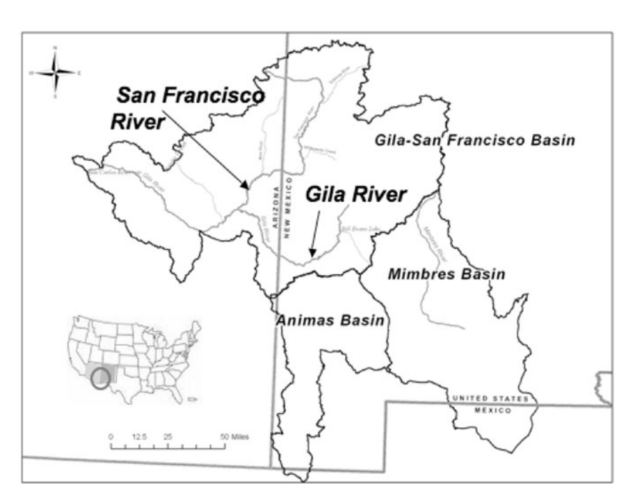
Figure 1. Map of the region featured in this case study.

Thirteen individuals (including two of the authors) from 10 institutions and organizations representing federal, state,